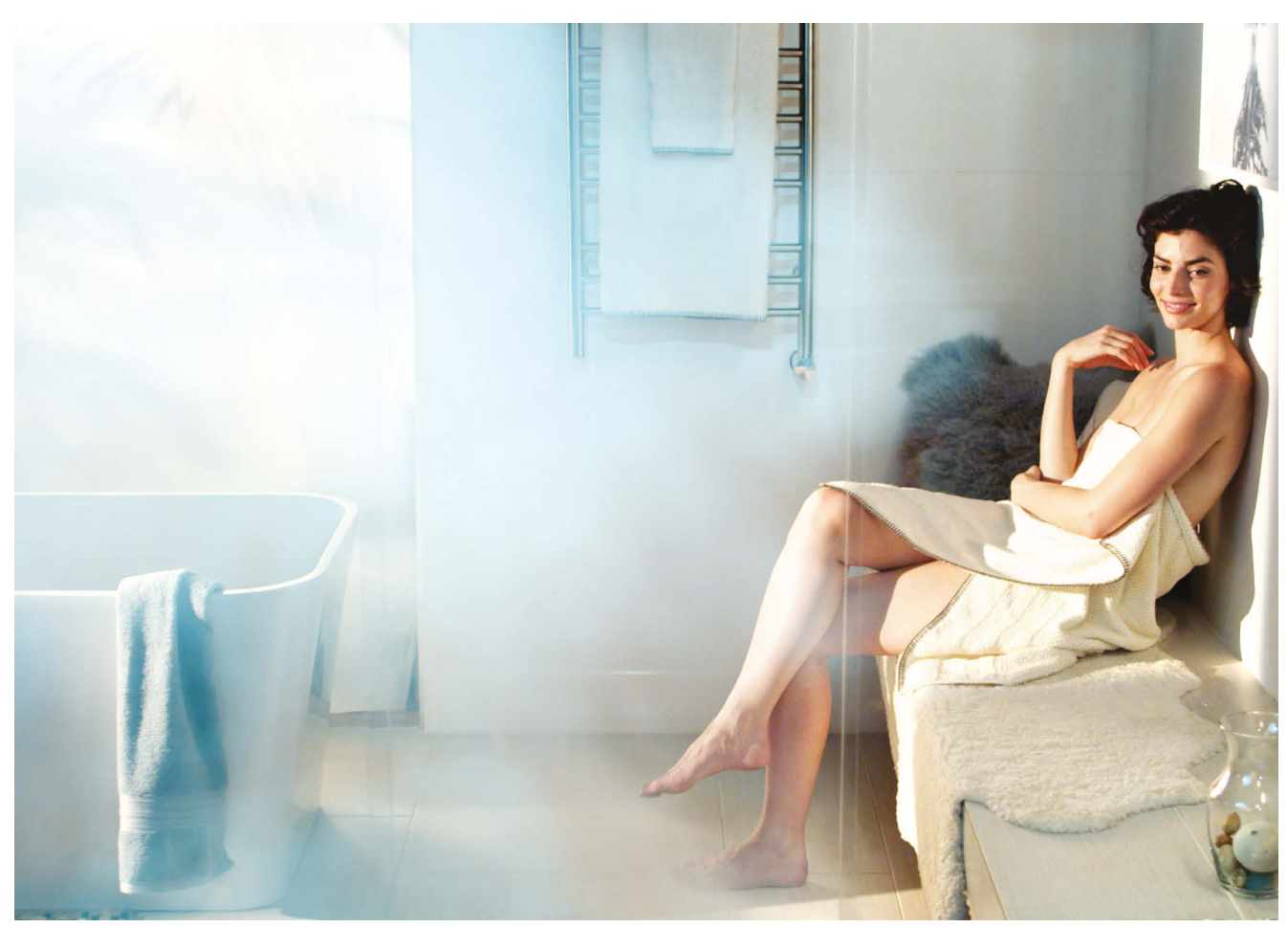
For Illustrative purposes only. Consult with qualified designer, architect or contractor for steamroom construction details and proper product placement.